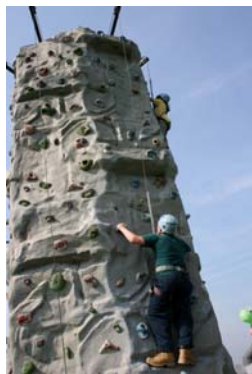
Mobile Climbing Wall

a campfire, brand some wood with their name, learn how to juggle and make Normans and Saxons Hel-