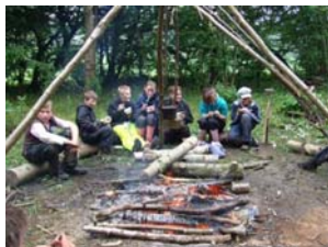
The First & Last Luxury Meal

The camp that took place over the bank holiday was a complete survival camp teaching skills such as skinning rabbits, gutting fish, making a compass, setting traps, foraging for food, building and sleeping in your own shelter and cooking all food on an open fire with no