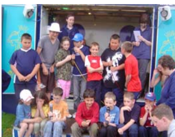
Hullabaloo Disco & Karaoke

Despite the high winds and heavy rain on Saturday and Sunday night, we all survived and had a great time.