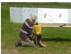
Air Rifle Shooting

ments. We also hired in a mobile climbing wall, lasertag shooting game and bouncy castle and slide for the cubs to take have a go at. Cubs also learnt some basic pioneering by building ballista's from canes and elastic bands, made their own badge, had their face painted and fired water rockets. Saturday evening ended with a campfire – a traditional time around a fire singing songs and having a good laugh.