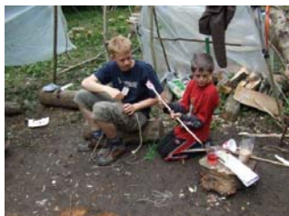
Making Dutch Arrows