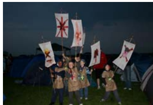
Normans or Saxons?