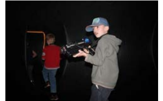
Lasertag Shooting Game

Anyone who did not receive a certificate or badge from the camp, please let me know asap and I will arrange this. There are a few badges left which are for sale for £1.00 each.