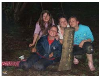
Crafty Carving by the Girls