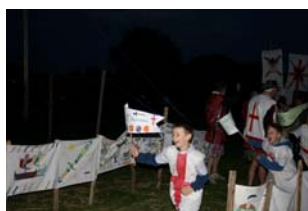
More Saxons or Normans?